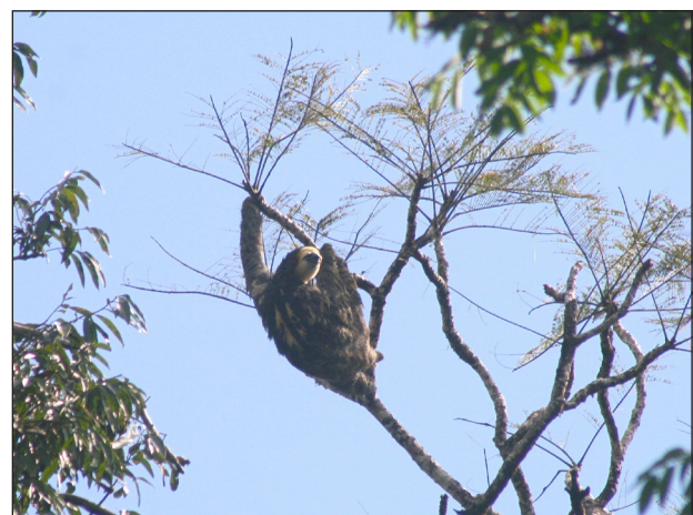
FIGURE 2. Male Bradypus tridactylus eating leaves of a Parkia velutina tree (Leguminosae: Mimosoideae) observed during boat surveys along the Araguari River on the border of the Floresta Nacional do Amapá (FLONA), state of Amapá, eastern Brazilian Amazon.