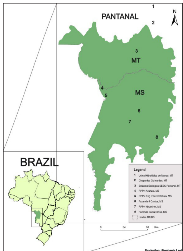
FIGURE 2. Giant armadillo detections in the Brazilian Pantanal. 1: Schneider (2000); 2: Cope (1889); 3: Trolle & Kéry (2005); 4: Schaller (1983); 5: this study; 6: P. Lima, pers. comm.; 7: Alho et al. (1987); 8: Trolle (2003).